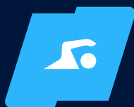
Open Water Swimming